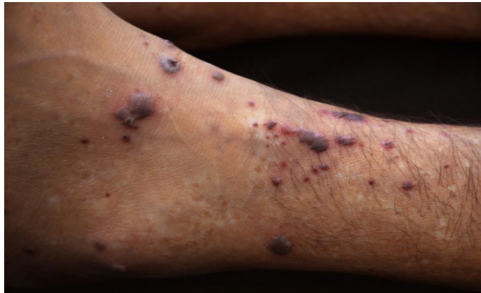
Figure 2 Palpable purpura and necrotic vesicles on the left lower limb.

inflammatory process with central caseation. The bronchoalveolar lavage revealed three alcohol-acid fast bacilli (AAFB).