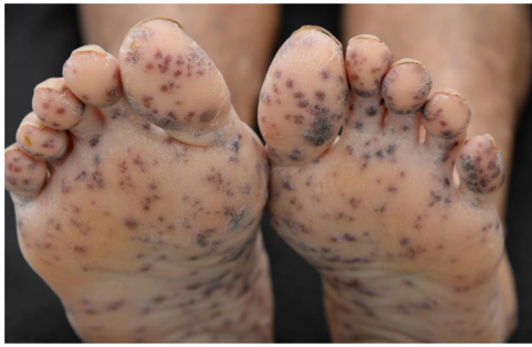
Figure 1 Multiple, bilateral palpable petechiae and purpura on the soles.