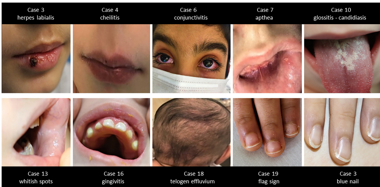
Figure 2 Some of the mucosa, nail and hair findings of the study group.

Nine (19.5%) patients out of 46 had developed MIS-C. Each of them presented pulmonary involvement with systemic end-organ involvement such as cardiovascular and renal involvement. MIS-C patients had mucocutaneous manifestation except one (88.8%). Patients with MIS-C exhibited substantially more skin and mucosal findings than patients without it. The most striking manifestations of nine MIS-C patients were seven periorbital erythema and edema, five conjunctivitis, and/or five cheilitis. The most frequent patterns the authors encountered in this group were two maculopapular rashes, one morbilliform rash, and one confluent erythema. Age, sex, initial systemic manifestations, patterns of the lesions, the presence of MIS-C, result of the PCR test, and treatments of cases with COVID-19 with skin, hair, and nail findings are seen in Table 3. Three patients developed skin manifestations simultaneously with COVID-19 symptoms such as fever, asthenia,