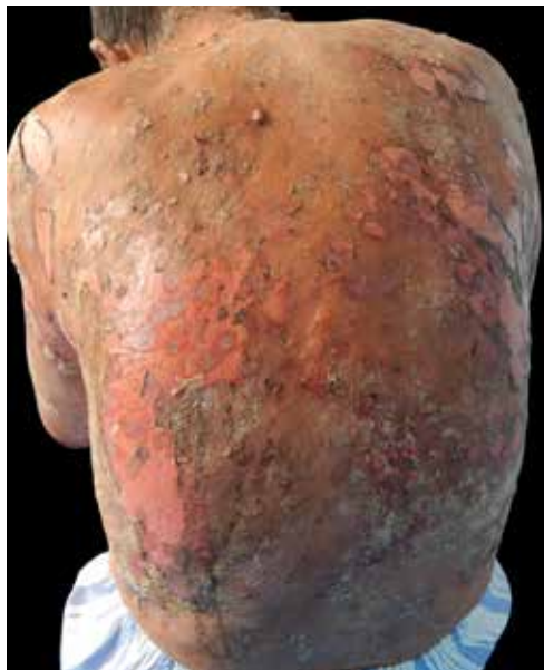
FIGURE 1: Numerous erosions and blisters on the back

ment, he showed significant improvement: all lesions began to heal with no new vesicle eruptions. However, acute renal failure (ARF) occurred. The liver and renal function tests showed total protein in serum of 56.5 g/L (normal is 60-83 g/L), in creatinine of 258.0 \mu\text{mol/L} (the normal is 45-85 \mu\text{mol/L} ), in urea of 19.26 mmol/L (the normal is 1.7-8.3 mmol/L), and in uric acid of 560.0 mmol/L (the normal is 214-488 mmol/L). The blood count test was normal. His urine volume was no more than 400 ml within 24 hours, and routine urinalysis revealed ERY++++, PRO+. The next day, the patient's physical condition became worse: total protein in serum was 45.7 g/L; creatinine, 384.9 \mu\text{mol/L} ; urea, 34.67 mmol/L; and uric acid, 748.0 mmol/L.