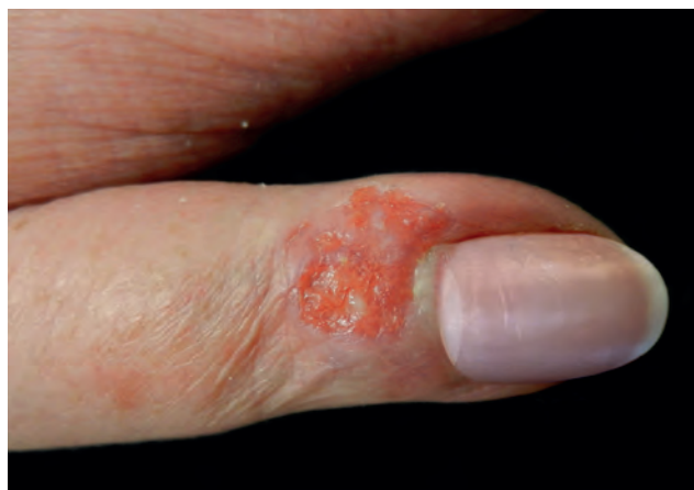
FIGURE 1: Granulomatous and friable ulcer with infiltrated margins, measuring approximately 2cm, located in the periungual region of the left thumb

Upon examination, we observed a granulomatous and friable ulcer with infiltrated margins measuring about 2cm in diameter (Figure 1).