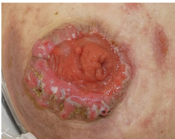
Figure 1 Hyperkeratotic lesions presenting with well-circumscribed vegetating and keratotic appearances surrounding the stoma.