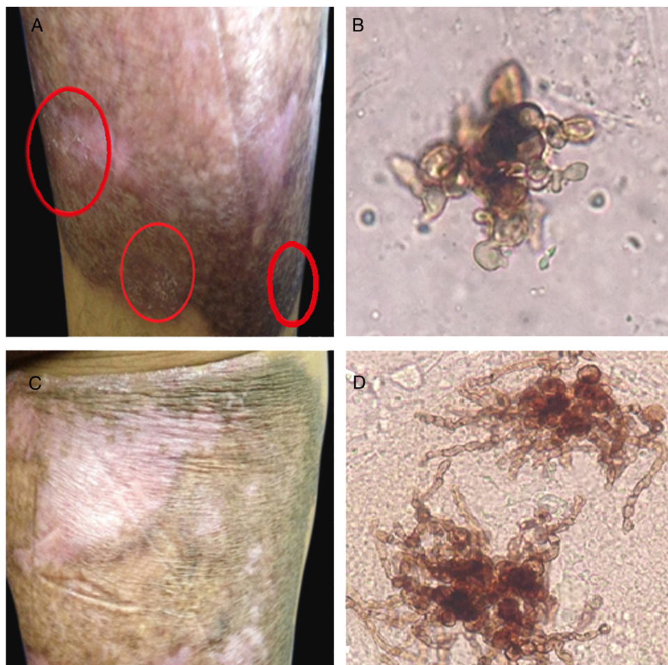
Figure 3 Six months of therapy with itraconazole. (A) Plaque border with fine scaling, and black dots. (B) Sclerotic cells with emission of short filaments or “Borelli spiders”. One year after treatment with itraconazole. (C) Scaling on the superior border of the plaque. (D) Sclerotic cells with emission of long filaments or “Borelli spiders”.

was deposited in the GenBank database ( Rhinocladiella aquaspersa Access No. MG996793).