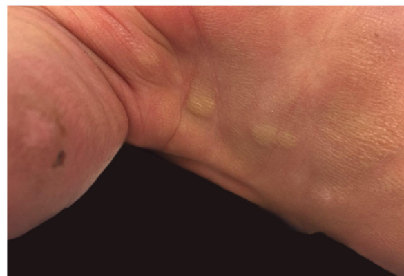
Figure 2 Erythematous brownish plaques on lower limb, topped by blisters at different stages of development (stray blisters, flaccid blisters and exulcerations).