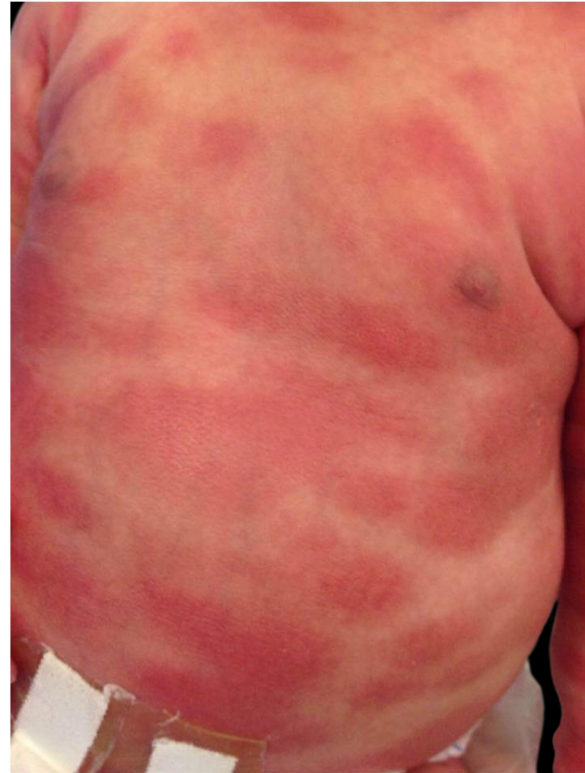
Figure 1 Erythematous plaques present at birth.

At that moment, prednisone 1 mg/kg/day was introduced and a skin biopsy performed. The skin biopsy revealed numerous of diffuse mast cells cutaneous infiltrates stained in metachromically toluidine blue staining, confirming the diagnosis of mastocytosis (Fig. 3). Immunohistochemistry CD117 (c-kit) evidenced massive positivity of mast cells