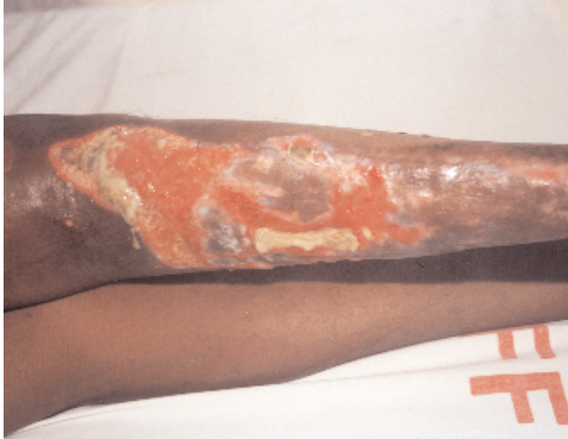
FIGURE 3: Still extensive ulcerated lesion, with clear bed and 50% integration of skin graft

controlled and less intense pain, he presented four round-shaped ulcerated lesions with yellow bed, in the anterior tibial region of the LLL, which were extremely painful, ranging from 0.5 to 2cm of diameter (Figure 4). Pentoxiphilin was then begun twice daily at the dose of 400 mg, and left lumbar sympathectomy was carried out, improving LLL pain and stabilizing lesion growth.