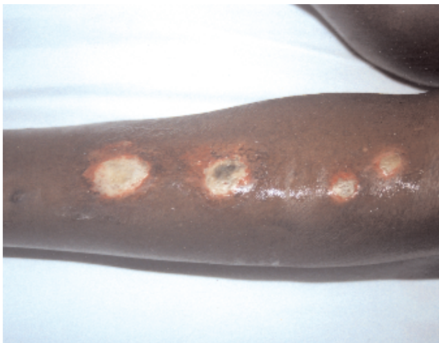
FIGURE 4: Round-shaped ulcerated lesions with fibrinous bed and erythematous halo in the tibial region of the left lower limb

In the 84th day of hospitalization he was discharged after important improvement of the RLL ulcerated lesion, healing of the two lower thirds of the lesion, maintaining the upper third ulcerated, with no infection, and with granulation tissue – and discrete improvement in the LLL. He was then using morphin 30 mg 4/4h, propranolol 320mg/d, captopril 150mg/d, nifedipin 40mg/d, acetylsalicylic acid