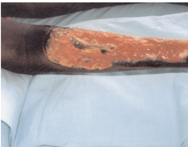
FIGURE 1: Extensive ulcer with yellowish bed, with necrotic areas and tendon exposure, affecting the entire right calf; mid third with granulation tissue

After 70 days of hospitalization, with his AP