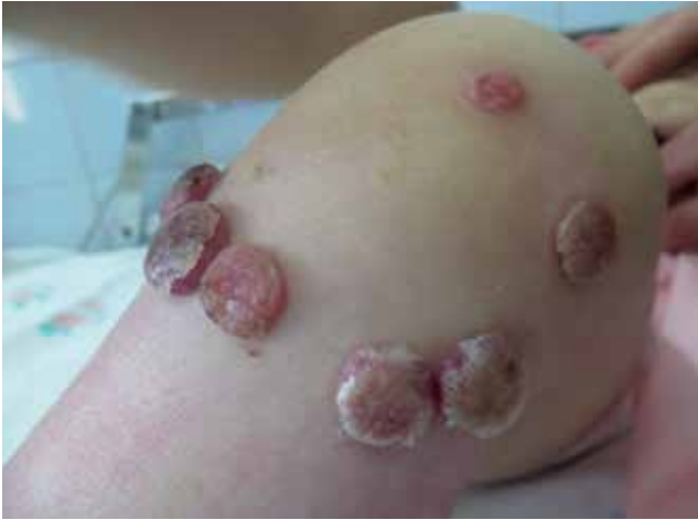
FIGURE 1: Multiple erythematous pedunculated nodules around burn scar on knee