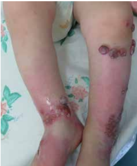
FIGURE 2: Numerous red papules on burn scar on shins