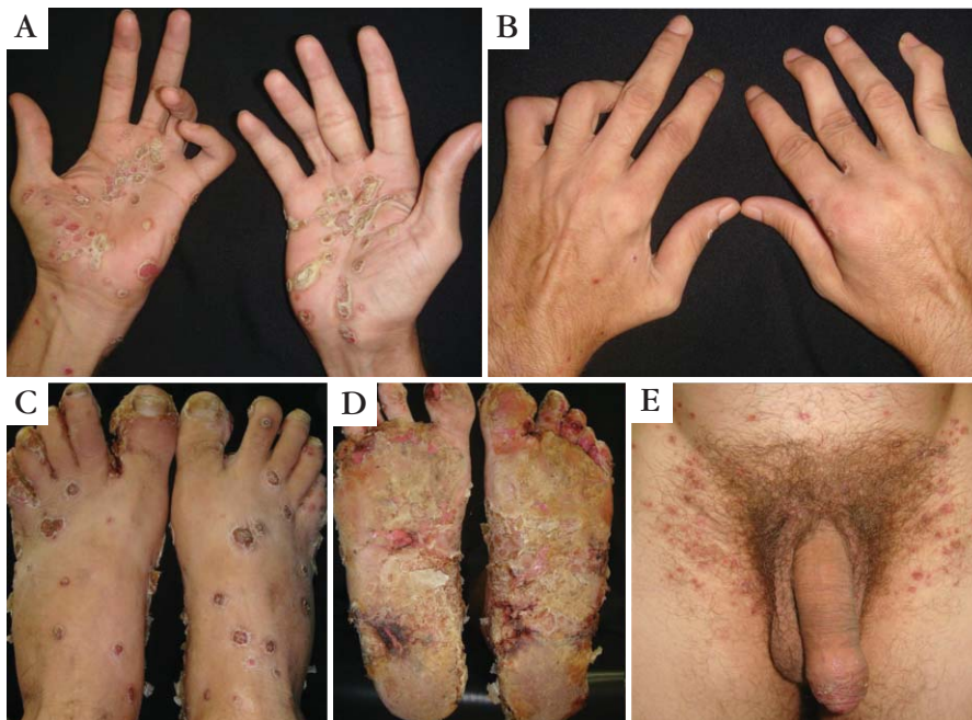
FIGURE 1: Erythematous-squamous plaques, some of them with crusts and fissures, bilaterally and predominantly in the inguinal and palmo-plantar regions

Since the beginning of the AIDS epidemic, a worsening of psoriasis progression is observed in patients with HIV infection, with sudden exacerbation of the clinical picture, onset of extensive cutaneous lesions, unguinal and palmo-plantar expressive involvement, in addition to more aggressive articular affect-