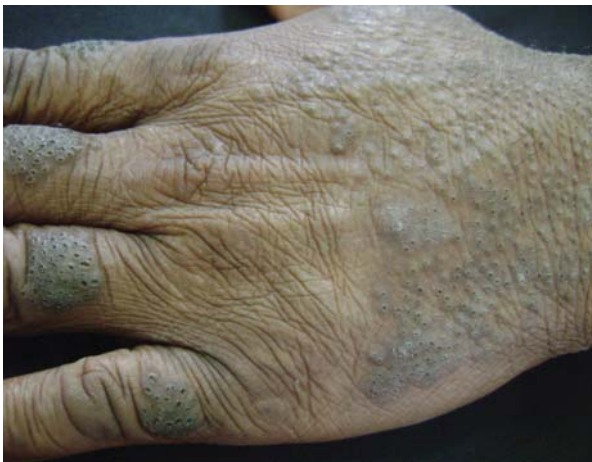
FIGURE 2: Detail of lesions: black follicular papules with follicular obliteration on backs of hands and fingers

15% urea cream was initially prescribed to be applied twice daily, with 0.05% retinoic acid to be used at night. The patient was also instructed to use a loofer (natural vegetable sponge) when showering. No improvement was observed after one month. Although advised of the importance of staying away from work, the patient failed to do so and only