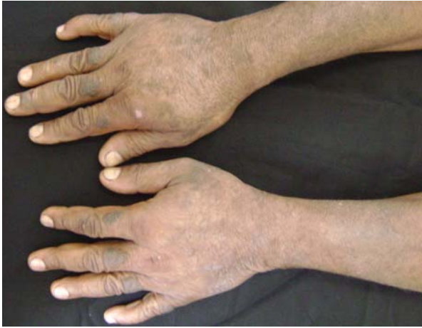
FIGURE 1: Follicular obliteration on upper limbs. Patient complained of itchy black spots on the upper limbs which emerged four months ago

formed punch biopsy of a lesion on the dorsum of the third finger of the left hand. Histopathological examination detected infundibular hyperkeratosis, atrophy and obstruction of the ostium of the follicle wall, with mild inflammatory infiltrate. The adjacent epidermis was observed with acanthosis, hyperkeratosis hypergranulosis, without inflammatory infiltrate (Figure 3).