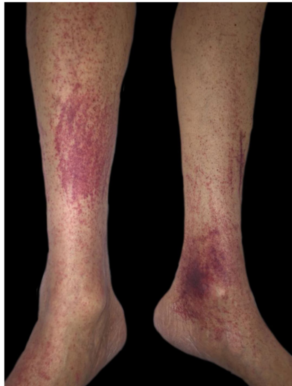
Figure 1 Purpuric areas in the lower limbs.

Scurvy is caused by ascorbic acid (vitamin C) deficiency; vitamin C is found in fresh fruits and vegetables. 2,3 Throughout history, scurvy was mostly diagnosed during the great Irish potato famine between 1845 and 1849, when the population of that country was reduced by 20% to 25%, the American civil war, and more recently the Afghanistan war in 2002. Although uncommon and remembered for its historical significance, scurvy is not a non-existent disease, especially in individuals with unusual diets, the elderly, alcoholics, patients with neoplasms or intestinal absorption disorders, and patients on hemodialysis. The kidneys reabsorb vitamin C and excrete it in the urine only when it exceeds the serum level; however, in dialysis this clearance is indiscriminate, increasing the risk of deficiency. 3