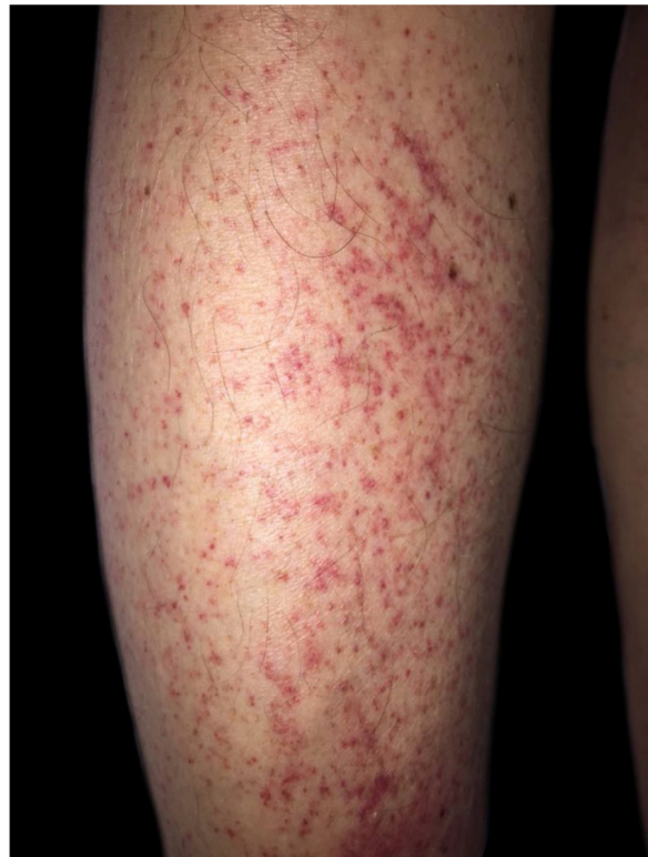
Figure 2 Perifollicular purpura.