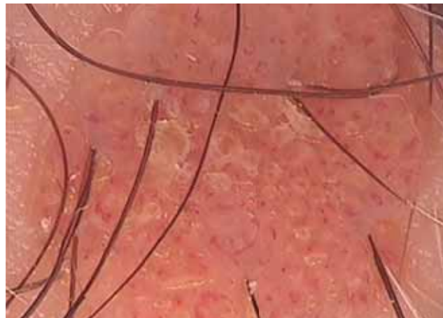
FIGURE 3: Many comma-like vessels on the dermal nevus

different diameters in irritated seborrheic keratosis. 1,3