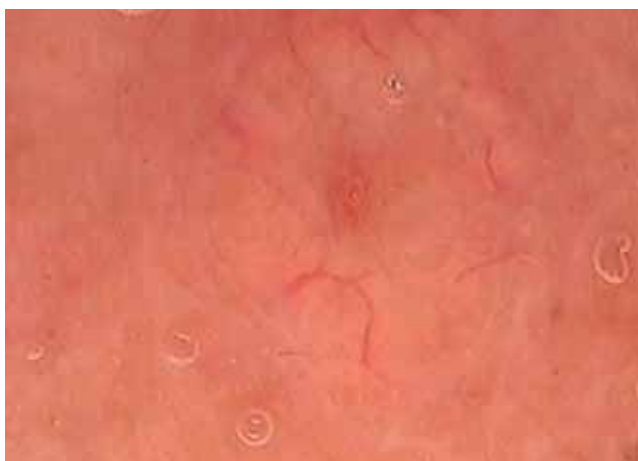
FIGURE 4: Crown vessels surround yellowish polylobular sebaceous glands located at the core of sebaceous hyperplasia

They can sometimes be mistaken for typical BCC vessels. 63 However, BCC vessels are brighter, with sharper borders, and frequently enter the core of the lesion. 12 Furthermore, crown vessels are surrounded a yellow-white, structureless core in molluscum contagiosum. 64