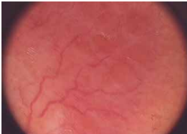
FIGURE 1: Arborizing vessels and orange areas on the lupus vulgaris lesion

syringoma, nodular melanoma and other tumors with diameters of over 3mm mimic BCC at first glance, but vessels in these tumors display a more homogenous arborization. Moreover, thick, arborizing vessels can appear in juvenile xanthogranuloma, Merkel cell carcinoma, angiohistiocytoma, hidradenoma, intraepidermal poroma and epidermal cysts. 19-21