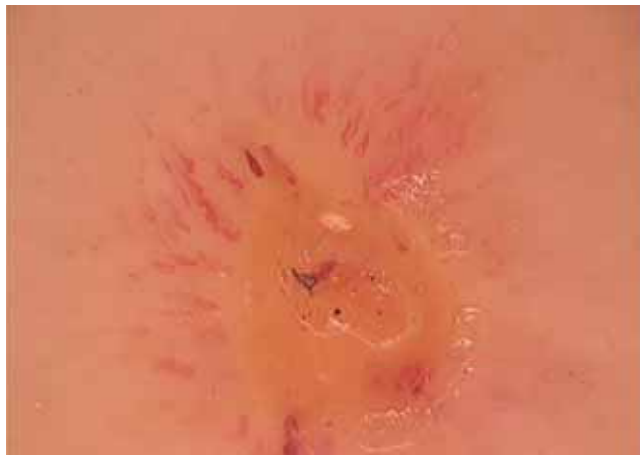
FIGURE 2: Hairpin-like vessels around excoriating lesion