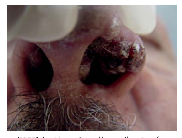
FIGURE 1: Nasal leprosy. Tumoral lesion with crusty surface within the nasal cavity