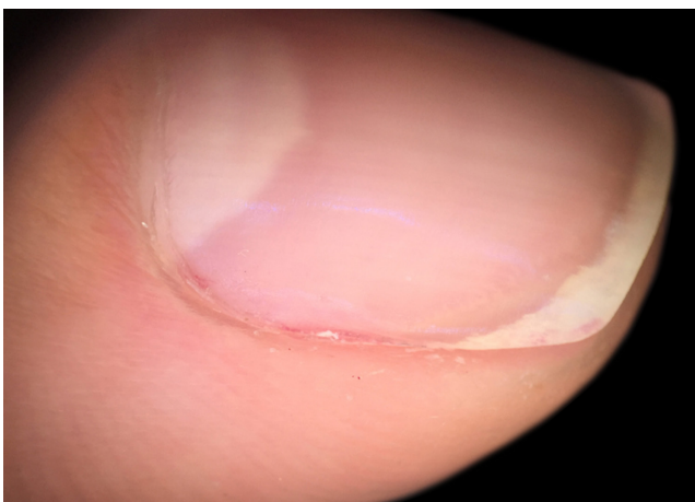
FIGURE 2: Clinical clearance of the lesions 15 days after the third procedure