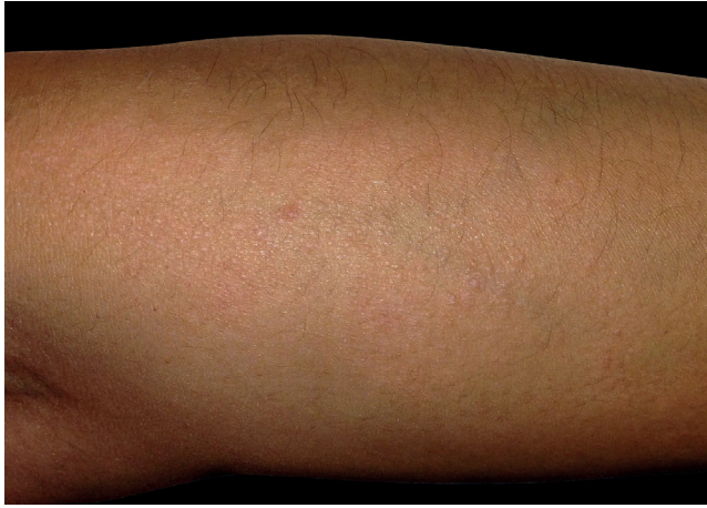
FIGURE 1: Small skin-colored papules, some of them translucent, symmetrically located on the dorsum of both forearms