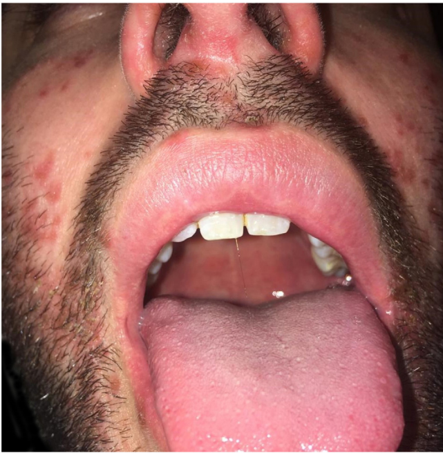
Figure 1 Oral enanthema.