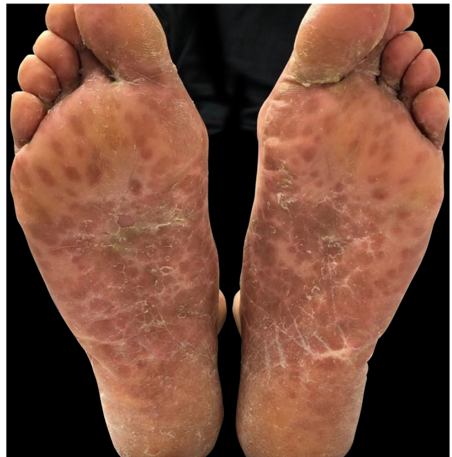
Figure 2 Erythematous purpuric macules and papules, and isolated blisters, located on the feet.