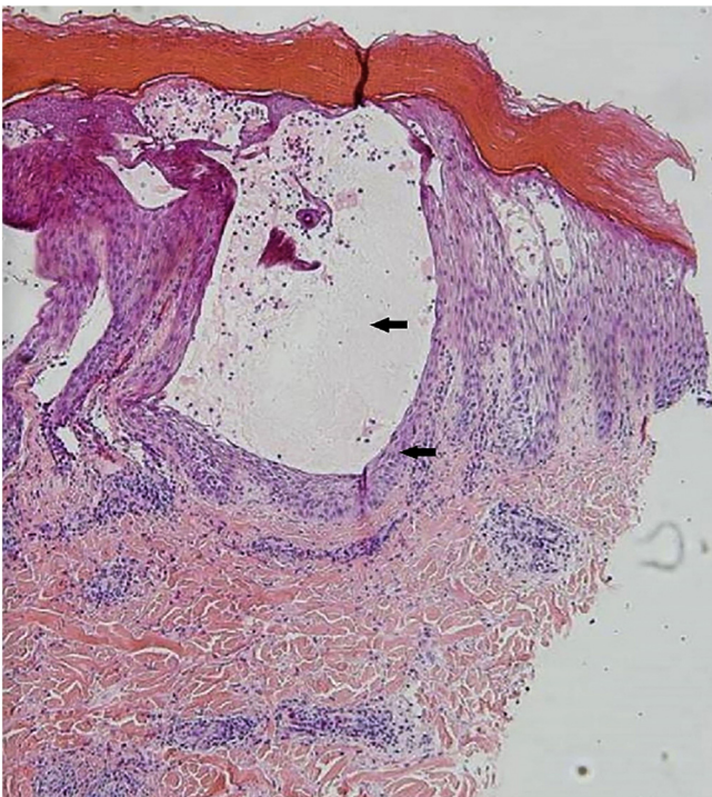
Figure 4 Skin biopsy on the arm showing intraepidermal blister and intense spongiosis (Hematoxylin & eosin, 40×).