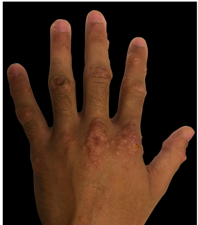
Figure 3 Multiple erythematous papules, with confluent areas, located on the hands.

In the oral cavity, HFMD may appear as lesions ranging from enanthema with blisters to ulcers that may affect any area of the oral mucosa. Therefore, it must be differentiated from other diseases that affect the oral cavity, such as acute herpetic gingivostomatitis (AHGS), recurrent aphthous stomatitis (RAS), herpes simplex, and herpangina. In AHGS and RAS, the lesions tend to be bleeding ulcers that affect the gums, tongue, hard palate, and, in some cases, the pharynx. Herpangina appears as a painful papulo-vesicular enanthema, which can progress to small grayish-yellow ulcers with erythematous borders. In most cases, it compromises the soft palate, tonsils, and posterior pharynx and is usually preceded by a high fever. However,