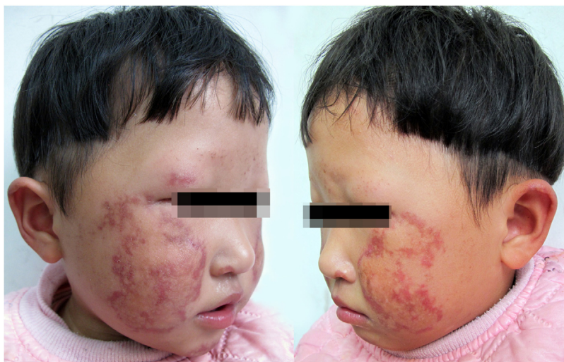
Figure 1 Poikiloderma in a patient with RTS. Depigmentation, hyperpigmentation, punctate atrophy, telangiectasia, and loss of eyebrows are seen bilaterally on the face.