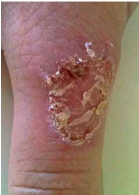
FIGURE 2: Figure 1 lesion in detail