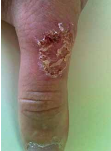
FIGURE 1: Scaly plaques with raised ridges and an atrophic center on the dorsal surface of the right first digit