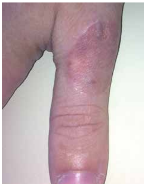
FIGURE 5: Lesion after excision and reconstruction with graft

predilection has been reported. It often affects the limbs and the involvement of a single digit is unusual. It starts as small and asymptomatic hyperkeratotic skin colored to brownish papules. The lesions can spread over years to form a plaque with raised ridges that can cover an area bigger than 20 centimeters in diameter. The center of the lesions may be hyperpigmented, hypopigmented, atrophic and/or anhidrotic, and occasionally hypertrophic. 2,3,4 PK dermoscopy shows yellow-brownish cornoid lamellae and linear, globular, or dotted vessels. 1 Differential diagnoses include: actinic keratosis, stucco keratosis, psoriasis, Darier's disease, basal cell nevus syndrome, among others. 2,5