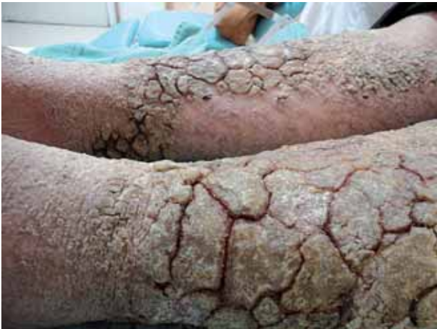
FIGURE 2: Darier's disease. Symmetric involvement of lower limbs with marked keratosis. There are fissures, which may lead to secondary infection