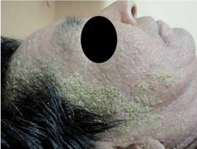
FIGURE 1: Darier's disease. Presence of keratotic and scaly lesions in the temporal and preauricular regions