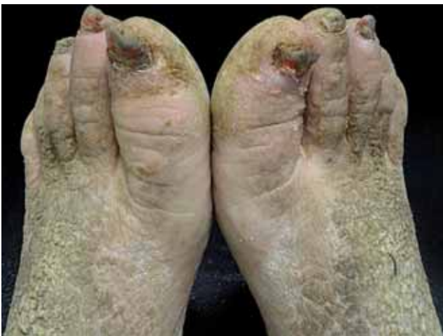
FIGURE 3: Darier's disease. Unguinal involvement with keratosis and dystrophy of nails in both feet