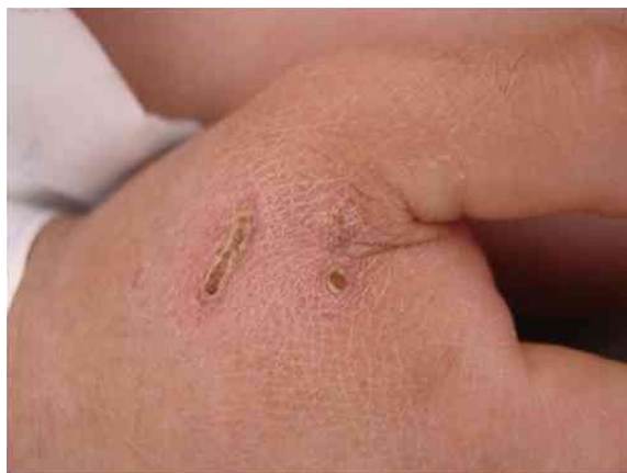
Figure 1 Lesions caused by cat scratches presented by a 28-year-old man with Bartonella sp. infection detected by polymerase chain reaction.

is through body lice, the reason why this pathogen is strongly associated to unsanitary conditions and poor personal hygiene. 31 The disease is also known as quintana fever or five-day fever, and it has an incubation period of 15–25 days. TF can be asymptomatic or severe. Approximately half of those affected experience a sudden onset of flu-like symptoms with no respiratory symptoms and short duration. High and prolonged fever can occur over several weeks. Symptoms remit for many days and after an asymptomatic period there can be paroxysmal clinical exacerbation three to five times or more within a year. 30 Eighty to 90% of patients present with erythematous, maculopapular lesions of up to 1 cm on the trunk. 32 Furred tongue, conjunctival congestion, and musculoskeletal pain are frequently associated. 33