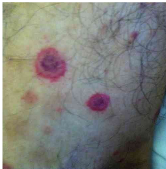
Figure 3 Cutaneous vasculitis on the leg of a 42-year-old man with a history of cat scratches and fever, with a diagnosis of B. henselae endocarditis confirmed by polymerase chain reaction, serology, and culture.

It has been suggested that the difference between the angiogenic and granulomatous response triggered by the organism observed in BA and CSD, respectively, appears to be determined by the degree of the host's immunocompetence. 51,52 The concurrence of lesions with clinical and pathological features of CSD and BA, also reported after the use of corticosteroids, with the