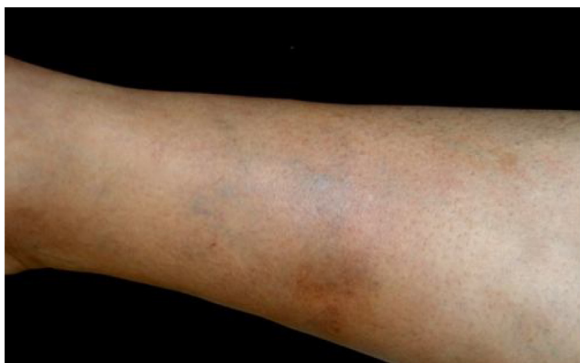
Figure 5 Sclerosing panniculitis with recurrent anemia. Sclerosing panniculitis in the right leg of a 32-year-old woman with a history of recurrent anemia of unknown origin. The patient subsequently tested for positive B. henselae DNA in blood samples.

with deflazacort 7.5 mg/d, methotrexate 15 mg/week and hydroxychloroquine 400 mg/d for 2 years, with a diagnosis of sarcoidosis. The anatomopathological examination of the skin was compatible with annular granuloma. B. henselae DNA was amplified in a fragment of a mediastinal lymph node and in the patient's blood.