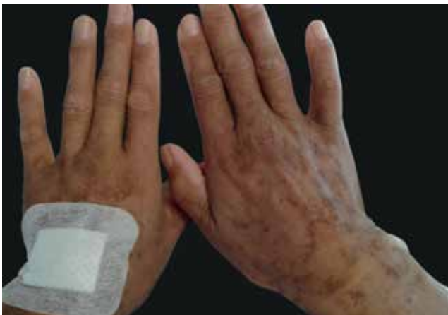
FIGURE 2: After treatment