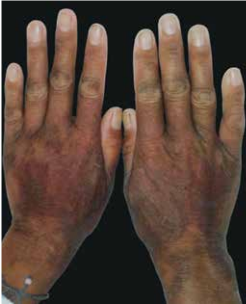
FIGURE 1: Before treatment