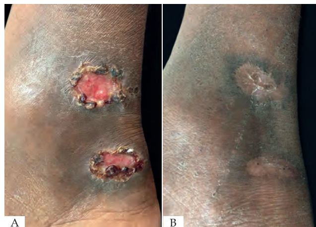
FIGURE 1: A - Before treatment with thermotherapy. B - After treatment with thermotherapy (only the larger lesion was treated)

It is possible that factors such as the host immunological response and their nutritional status, as well as differences between the species causative of the disease are responsible for the discrepancy between the cure rates found in the studies. Although in our study the Leishmania species causative of the disease was not identified, it is likely that the lesions have been caused by L. braziliensis in the majority of patients. 3 A study performed previously in Guatemala with 66 patients to assess the efficacy of thermotherapy demonstrated an efficacy of 73% in patients with CL by L. braziliensis and L. mexicana , the same as patients treated with systemic pentavalent antimonial. 34 In other two randomized studies that also compared thermotherapy with systemic pentavalent antimonial performed in Colombia, the cure rate was lower, around 60%. In these studies, the species responsible for the infection were L. panamensis , L. braziliensis and L. guyanensis . 35,36 If we compare the results of these studies with other