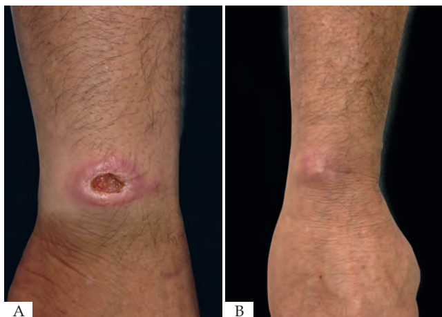
FIGURE 3: A - Before treatment with thermotherapy. B - After treatment with thermotherapy

*Two lesions progressed to cure with no need for treatment and were not included in the table.