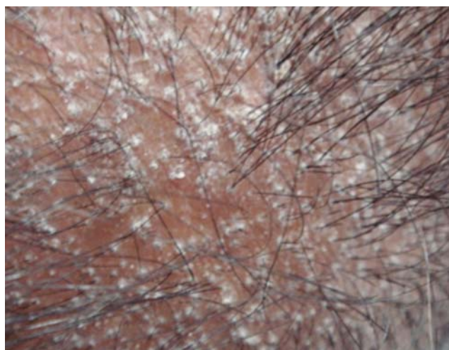
PICTURE 3: Detail of cicatricial alopecia on the scalp, showing keratosis and adherent squamiae