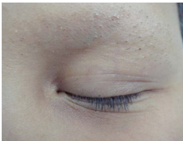
PICTURE 1: Follicular papules and hipotrichosis in the eyebrows with irregular eyelashes

However, hyperkeratosis does not seem to be