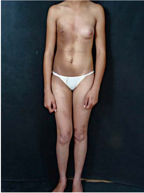
FIGURE 1: Hyperchromic brownish macula, with well defined limits and irregular border, geographic outline, located on the right anterolateral trunk