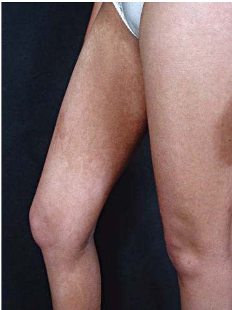
FIGURE 2: Expansion of the lesion to the internal region of the right thigh