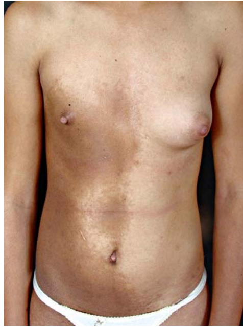
FIGURE 3: Ipsilateral mammary hypoplasia

more discrete is underdiagnosed. 3 On average, lesions occur around eight years of age and become more evident in puberty.