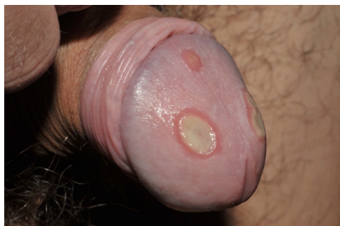
Figure 2 Shallow ulcers on the penis, with fibrin-containing floor.

Tuberculosis is considered multifocal when there is involvement of at least two extrapulmonary sites, with or without pulmonary involvement. It accounts for one-third of the mortality among patients infected with the human immunodeficiency virus (HIV), but it can also affect immunocompetent patients. 4