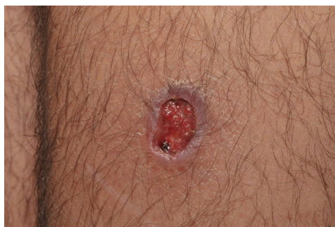
Figure 1 Well-delimited ulcer with clean floor on the leg.