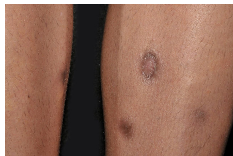
Figure 5 Complete healing of leg lesions after two months with RIPE treatment.

of any kind of immunosuppression. At colonoscopy, multiple shallow ulcers covered by thick fibrin associated with enanthem, mainly in the sigmoid, and aftoid ulcers in the proximal rectum were evidenced. The tuberculin sensitivity test (PPD) was negative and the chest X-ray had no alterations. Anatomopathological examination of one of the ulcers was performed on the lower limb, which revealed an epithelioid granulomatous process with palisade granulomas and central caseous necrosis. The study of acid-fast bacilli (AFB) by Ziehl-Neelsen staining showed intact bacilli (Figs. 3 and 4), and culture was positive for M. tuberculosis , confirming the diagnostic hypothesis of cutaneous TB. The histopathological analysis of the intestinal biopsy revealed a mild inflammatory infiltrate without the presence of bacilli. After the beginning of the RIPE treatment regimen, the patient evolved with complete healing of the ulcers (Figs. 5 and 6) and gradual resolution of the diarrhea and oligoarthritis.