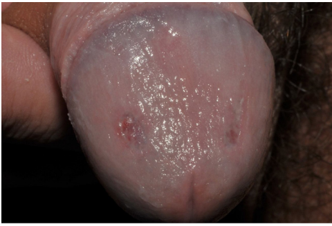
Figure 6 Complete healing of penile lesions after two months with RIPE treatment.