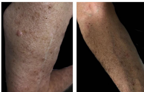
Figure 2 Remission of lesions in right arm (A) and forearm (B).