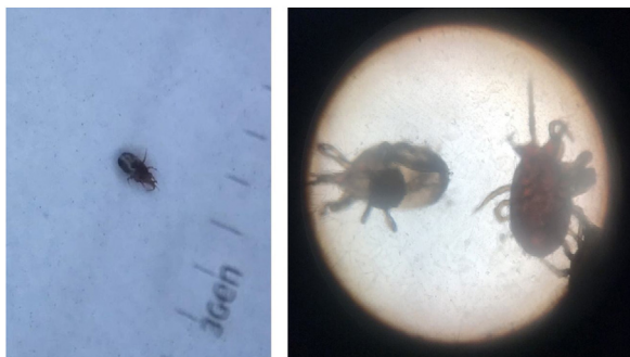
Figure 3 (A) Dermoscopy of the mite. (B) Identification of mites of the species Dermanyssus gallinae by optical microscopy.

and air-conditioning boxes. There are also nosocomial cases. 1,2