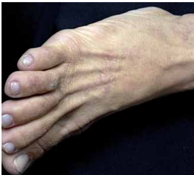
FIGURE 1: Grouped keratotic normochromic papules, with linear disposition on the dorsum of right foot

Type 1 phenotype of DD is the most common. 2,4,5 The skin surrounding the affected areas is normal. A post-zygotic somatic mutation would explain this variant. 5 If genetic mosaicism involve the gonads, the mutation may be transmitted to descendants and potentially result in widespread disease. 4,5 In the case presented there was no similar history among siblings