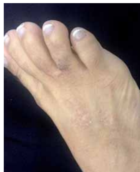
FIGURE 4: Partial improvement of cutaneous clinical picture demonstrated by the decreasing number of papules and keratotic aspect of lesion