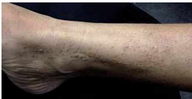
FIGURE 2: Erythematous and brownish keratotic papules grouped in a linear and ascending path on the anterior and medial face of right leg