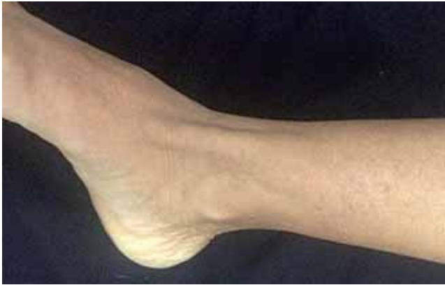
FIGURE 5: Complete resolution of lesions on the leg after topical treatment

and daughters, suggesting a post-zygotic mutation with no gonadal involvement. Histological findings do not differ from those of widespread disease. 4