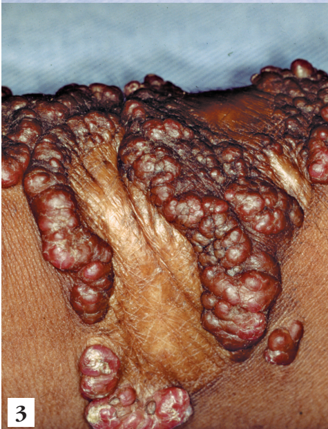
FIGURES 1, 2 e 3: Erythematic-violet lesions with verrucous surface, located in right hand and forearm