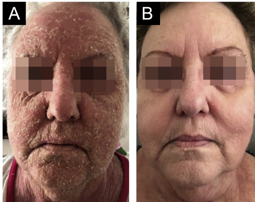
Figure 3 (A) Desquamation of the entire face before treatment. (B) Complete resolution with therapy

erythrodermic form and was treated with IV immunoglobulin. The case reported herein documents the successful use of this therapy in severe and extensive cases of pemphigus foliaceus, which is rare in this age group.