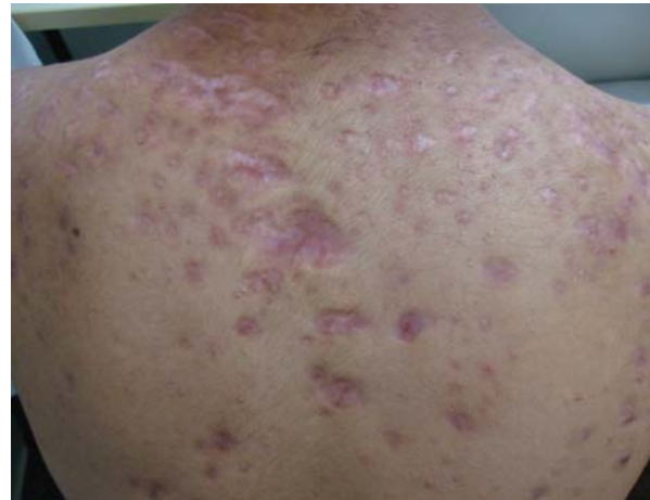
FIGURE 5: After two months of treatment: extensive scars on the back

ic abnormalities are characteristic of this disease. On the present case we regard the beginning of the therapy with isotretinoin as the triggering factor of the acne fulminans. 9,12 This could be explained by the increased fragility of the pilosebaceous ducts induced