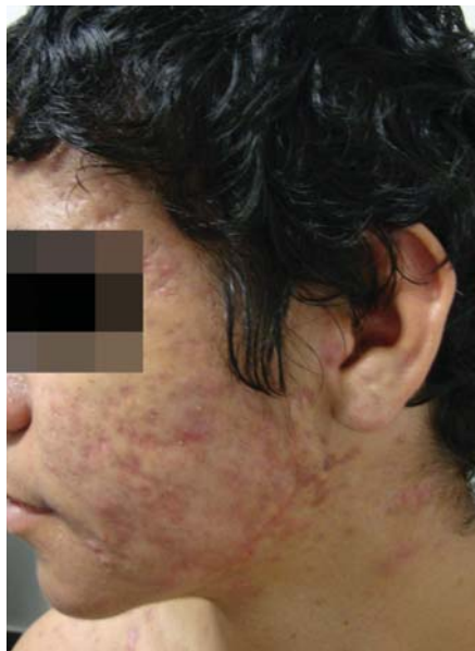
FIGURE 4: After two months of treatment: nodules and extensive scars on the face

ic abnormalities are characteristic of this disease. On the present case we regard the beginning of the therapy with isotretinoin as the triggering factor of the acne fulminans. 9,12 This could be explained by the increased fragility of the pilosebaceous ducts induced