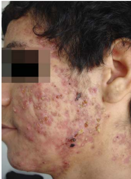
FIGURE 1: Papules, pustules, confluent nodules and ulceronecrotic lesions on the face

The reported case represents a typical case of acne fulminans, a rare manifestation with few cases described on the literature. The development of ulceronecrotic lesions on the face, back and chest in male young patients with moderate acne associated with fever, polyarthralgia, laboratorial and scintigraph-