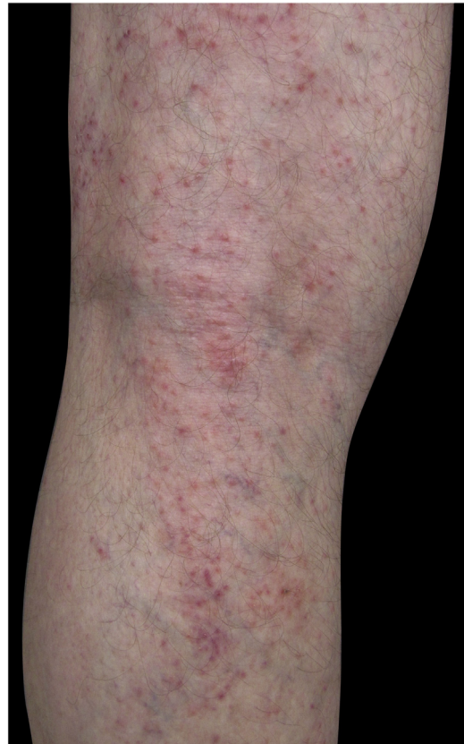
Figure 1 Eczema on the lower limb due to allergic contact dermatitis to corticosteroid.

Four (66.7%) of the six cases had lesions in the lower limbs, two (33.3%) in the upper limbs, one (16.7%) in