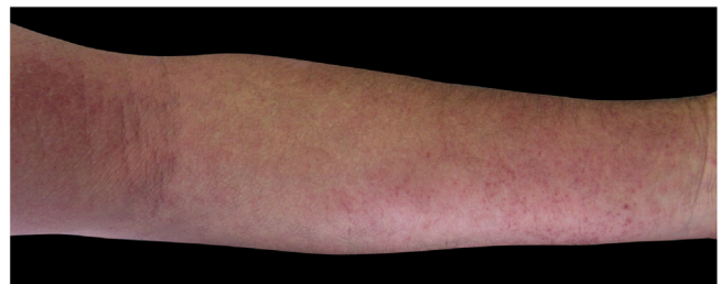
Figure 2 Eczema on the upper limb due to allergic contact dermatitis to corticosteroid.

the trunk, and two (33.7%) had a disseminated pattern (Figs. 1 and 2). The typical picture, as in the present cases, is a dermatosis that is refractory to treatment with corticosteroids, characterized by eczematous lesions, which may be more evident on the edges than in the center. More-