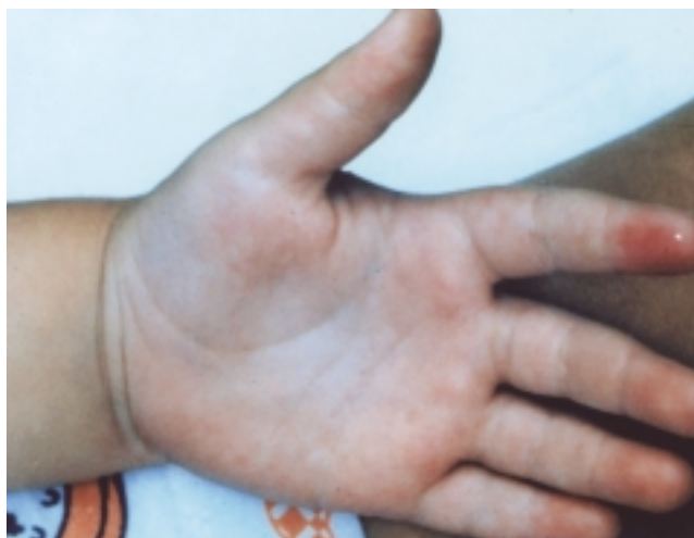
FIGURE 6: Details of arboriform spicules of a caterpillar of the Saturniidae family. Below: Accident on the hand of a patient with erythematous papules and discreet superficial cutaneous necrosis

1960's. As of 1989, however, accidents caused by Lonomia obliqua have taken up epidemic proportions in the western part of the State of Santa Catarina, the northern part of the State of Rio Grande do Sul, especially in regions near the cities of Chapecó and Passo Fundo, respectively. There has been an increased number of cases, even in the States of Paraná and São Paulo. 22-26 The areas where the caterpillar exists present temperate climate with annual average temperature of 63.5°F (17.5°C). It is likely that deforestation and ecological changes have contributed to a raise in accident rates.