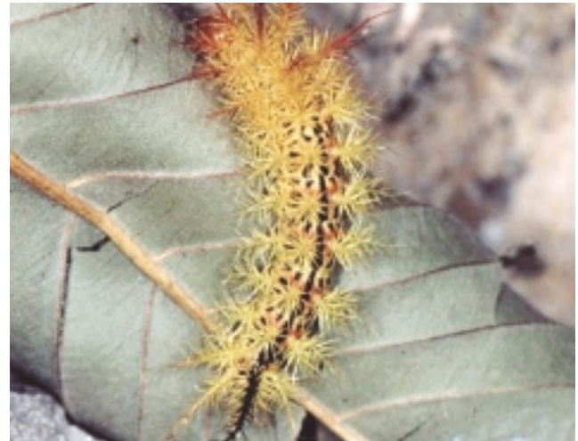
FIGURE 4: Caterpillar of a moth of the Automeris genus ( Saturnidae family). Observe the body spicules similar to small pine trees.

In general, toxins from all species contain thermolabile proteins. Some species have proteolytic enzymes, others are plasminogen activators and have