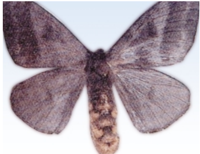
FIGURE 1: A female Hylesia sp moth responsible for accidents in humans

Similar cases were described in Central Africa, caused by species from the Anaphae genus. There is a controversy regarding abdominal spicules containing venom in their interior. The simple fact of the seta penetrating seems to be cause intense popular, pruritic