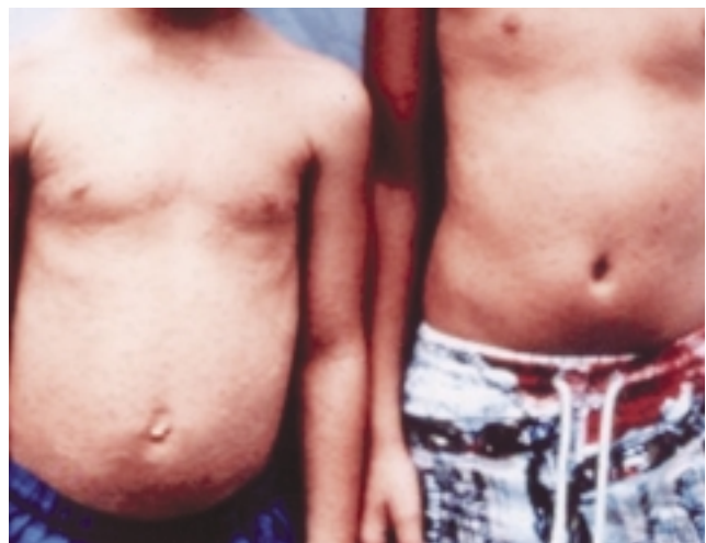
FIGURE 2: Two patients with pruritic, erythematous and papular eruptions after sleeping in a rural setting with moths of the Hylesia genus

This is a more serious and common accident, mainly associated with three families of moths: Megalopygidae, Saturnidae and Arctiidae. Eruca means larva. The most important genera of the Megalopygidae family are Podalia and Megalopyge (Figure 3). The Saturnidae family includes caterpillars that have less setae than those from the Megalopygidae family, whose aspect is similar to small pine