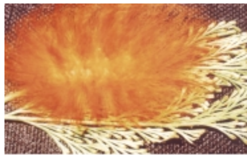
FIGURE 3: Above: Caterpillar of a moth of the Megalopyge genus ( Megalopygidae family). Below: recent accident. Observe slight erythema and edema, which are not compatible with the intense pain reported by the victim

The accidents are characterized by immediate intense pain, erythema, edema, vesicles, blisters, erosions, petechias, superficial cutaneous necrosis, ulcerations and lymphangitis (Figures 3, 5 and 6).