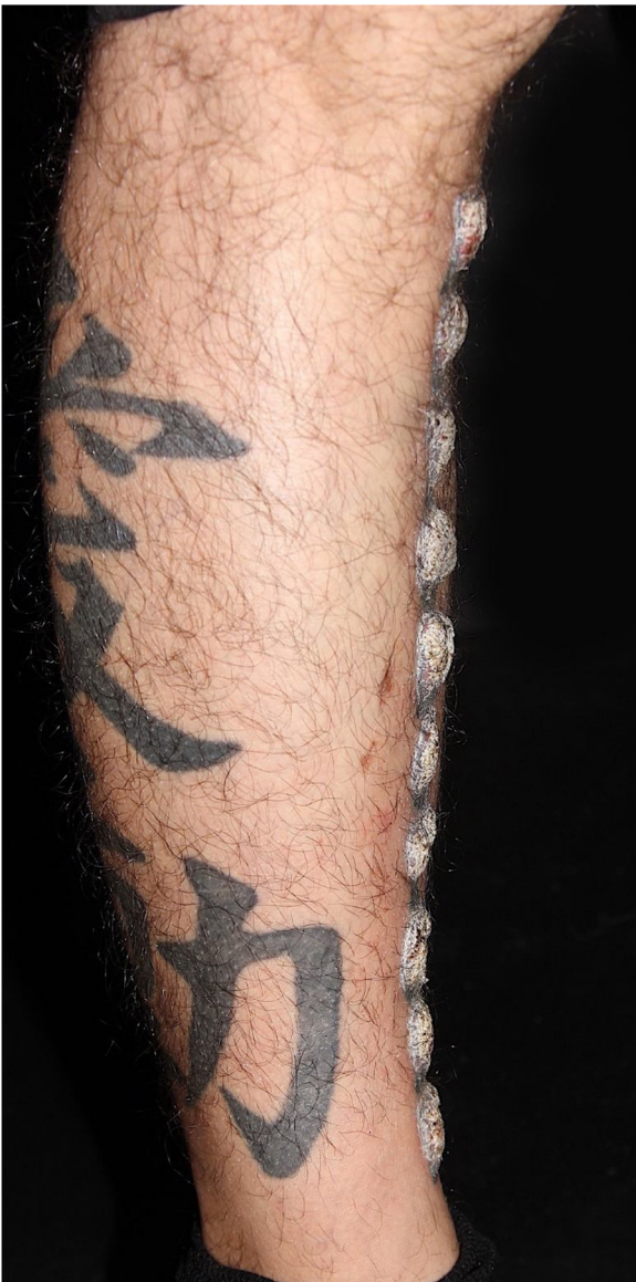
Figure 3 Lateral view of the verrucous lesions; notice a black tattoo with normal aspect on the lower leg.