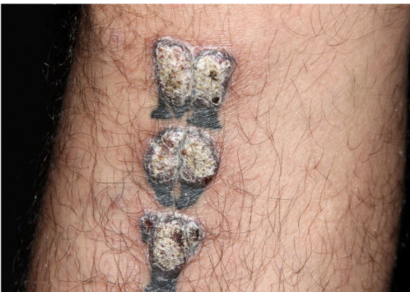
Figure 4 Closer view of the verrucous lesions - note that areas tattooed in black are spared.