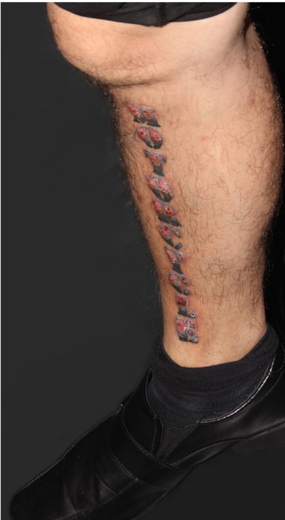
Figure 1 Clinical aspect of the tattoo approximately two months after the procedure: infiltration and inflammation of the red pigment area.

vacuolar degeneration of the basal layer. There was a nodular, diffuse and lichenoid infiltrate in the dermis, consisting predominantly of lymphocytes and histiocytes containing variable amounts of pigment. Marked inflammatory infiltrate aggression to the follicular epithelium was observed (Fig. 5). Special stains for microorganisms and tissue cultures for fungi and mycobacteria were negative. Immunohistochemistry showed: CD3 positivity in rare epidermal lymphocytes; CD4 and CD8 positivity in rare cells; CD4:CD8 ratio of 2:1; CD56 positivity in numerous mononuclear cells in the dermis. The final diagnosis of a lichenoid reaction to the tattoo red pigment was attained. Despite the lack of clinical response to the performed therapies (local infiltration of corticosteroids, and excision by shaving the verrucous lesions), the patient stated that he would certainly tattoo his skin again.