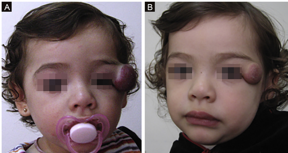
Figure 3 (A) Started treatment at 9 months old. (B) Poor response at 20 months old, when propranolol was stopped. Required surgical management (Patient #1).

conditions, arrhythmias, or a maternal history of connective tissue disease. 10