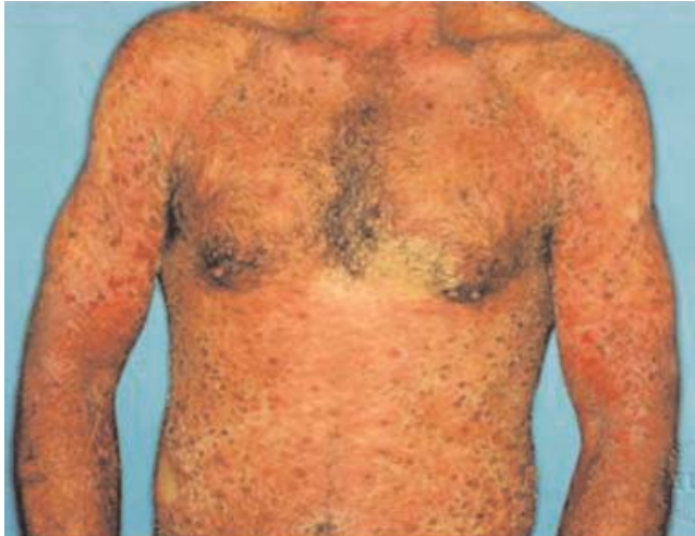
FIGURE 1: Erythematous papules and maculae on the chest. Ulcerous necrotic lesions, of 0,5 to 1 cm of diameter

condition was associated with a general malaise, high fever (40 degrees) and myalgia. Laboratorial exams presented hyponatremia, hypocalcemia and lymphopenia. FTAabs, VDRL, herpes 1 and 2 serology, Anti-HIV 1 and 2, were negative. The histopathological exam confirmed the diagnosis and revealed lymphohistiocytic inflammatory infiltrate, with intense aggression of epidermis, edema and vacuolar degeneration of keratinocytes, intense exocytosis, blistering, with evolution to ulcers and vascular congestion, with extravasation of erythrocytes (Figures 3 and 4), compatible with Mucha-Habermann disease. Prednisone (40 mg/day) was used with excellent therapeutic response. The corticosteroid