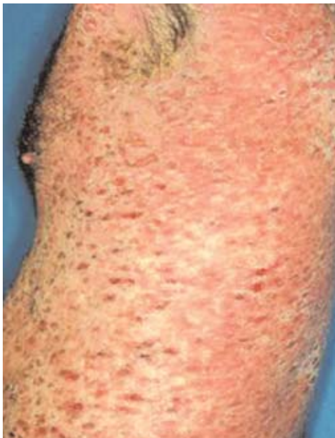
FIGURE 2: Macular and necrotic lesions on the chest

condition was associated with a general malaise, high fever (40 degrees) and myalgia. Laboratorial exams presented hyponatremia, hypocalcemia and lymphopenia. FTAabs, VDRL, herpes 1 and 2 serology, Anti-HIV 1 and 2, were negative. The histopathological exam confirmed the diagnosis and revealed lymphohistiocytic inflammatory infiltrate, with intense aggression of epidermis, edema and vacuolar degeneration of keratinocytes, intense exocytosis, blistering, with evolution to ulcers and vascular congestion, with extravasation of erythrocytes (Figures 3 and 4), compatible with Mucha-Habermann disease. Prednisone (40 mg/day) was used with excellent therapeutic response. The corticosteroid