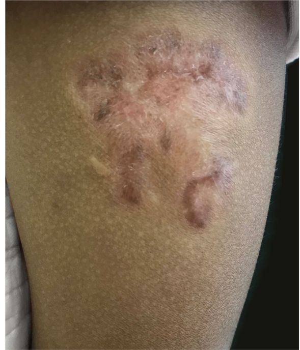
Figure 3 Scar at site of lesion post-treatment.