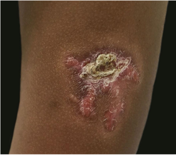
Figure 1 Well-demarcated erythematous scaly plaque with centrally adherent thick scales and finger-like extensions measuring 5×4 cm at site of BCG vaccine scar on left deltoid region.