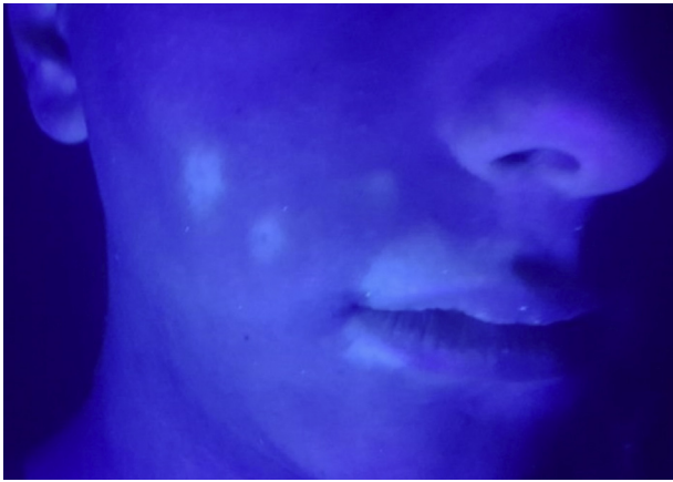
Figure 2 Wood's light examination revealed fluorescence bright blue-white in malar and perioral right regions.