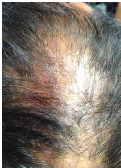
FIGURE 5: LPP

Clinical features of LPP are hair loss, severe itching, desquamation and burning sensation, which may be aggravated by stress, ultraviolet light and sweating. The stability of this condition is revealed by asymptomatic non-inflamed lesions and negative traction test. At this stage, it may be clinically indistinguishable from other lymphocytic