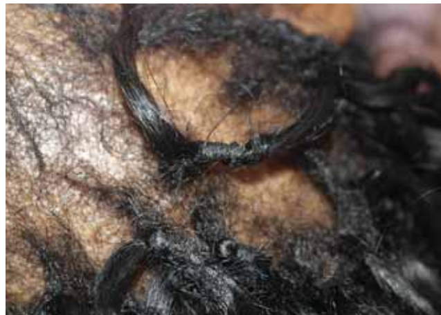
FIGURE 11: The line used to tie the hairpiece, shown in more detail

MEGAHAIR (EXTENSIONS): It consists in the addition of synthetic hair fiber or exogenous human hair with the same color characteristics and hair texture to the natural hairs of the patient, in order to make them longer. In order to insert the megahair, the natural hair must be braided close to the scalp. Then the hairpiece is sewn or glued to the base of the natural hair shaft, which ends up getting hidden by the extension (Figure 11). This method also requires low maintenance and the extensions may be washed, treated and stylized according to the wishes of the patient. However, although the use of megahair