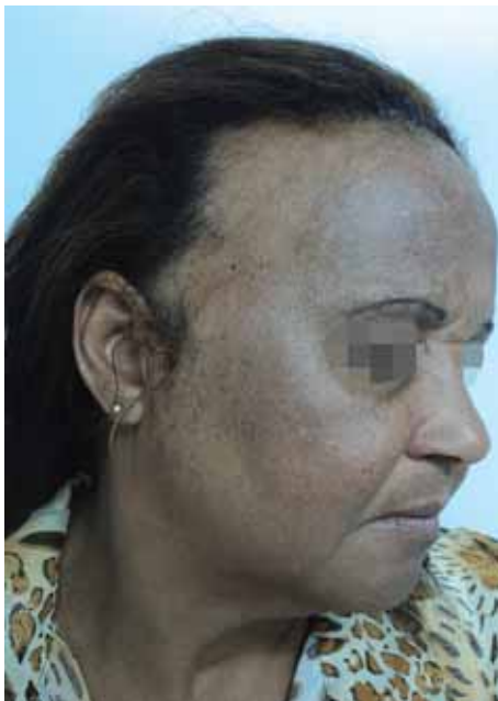
FIGURE 8: Lonely hair sign: presence of isolated and dispersed terminal hairs in the area of alopecia