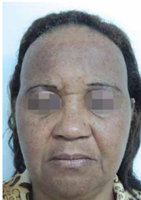
FIGURE 7: Frontal fibrosing alopecia: notice the retraction of frontotemporal hair line and thinning of the eyebrow

Frontal fibrosing alopecia (FFA) is a form of cicatricial alopecia characterized by progressive recession of the frontotemporal hairline. Most women