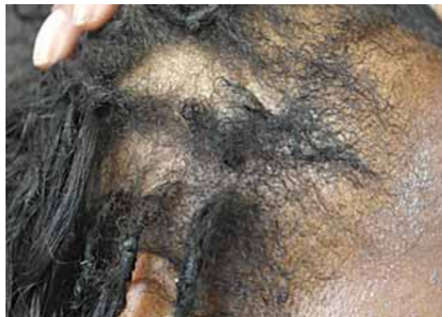
FIGURE 1: Traction alopecia. Observe the traction exerted by the hairpiece upon the hairs, resulting in the shortening of the hairs in the temporal region

Usually, the areas of alopecia are symmetrical along the frontotemporal line (Figure 1). 12 The involvement of the occipital region is unusual. 12 The earliest sign of TA is the perifollicular erythema,