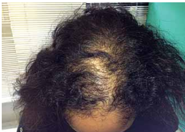
FIGURE 10: Androgenetic alopecia

With regard to other etiological, pathophysiological, diagnostic and therapeutic aspects, there is no distinction between the classically described findings of androgenetic alopecia in white women. However, in black women, the differential