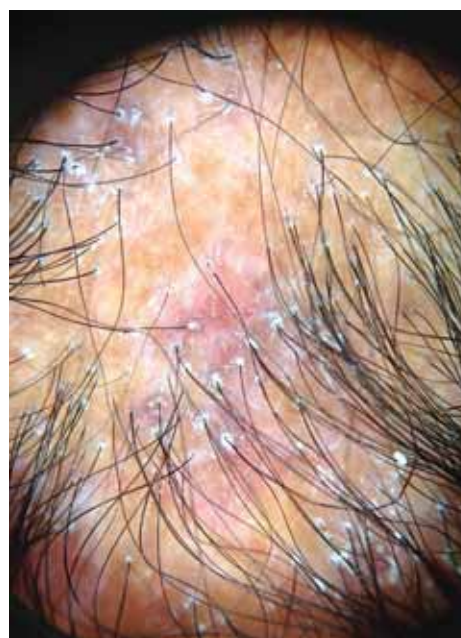
FIGURE 6: In melanodermic patients with LPP, we can observe a blue-greyish perifollicular pigmentation in a "target-like pattern", in addition to the characteristic features of perifollicular desquamation and erythema