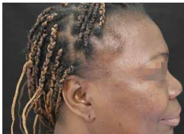
FIGURE 2: The fringe sign: short tonsured hairs outlining the original frontotemporal line of implantation of the hair

which may progress to folliculitis if the trauma is continuous. 4,17,18