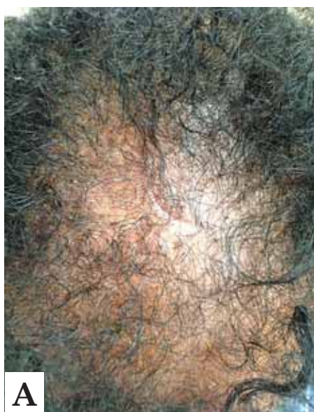
FIGURE 4:A. Cicatricial alopecia in the central scalp (CCCA). In this case, the differential diagnosis was made with androgenetic alopecia in black women

Biopsy is important to confirm the diagnosis. Ideally, two fragments should be obtained (for horizontal and vertical histopathological sections) with 4-mm punch biopsy specimens taken from the periphery or the active border of the alopecia area. 32 The histological findings are nonspecific and may be found in other forms of inflammatory scarring alopecia, however, the premature desquamation of the inner root sheath is the most specific and earliest feature of CCCA. 36 The involved follicles may have some or all of the following characteristics: eccentric epithelial atrophy with hair shafts in close proximity to the dermis; concentric lamellar fibroplasia; variably dense perifollicular inflammation, infundibular fusion, total destruction of the follicular epithelium