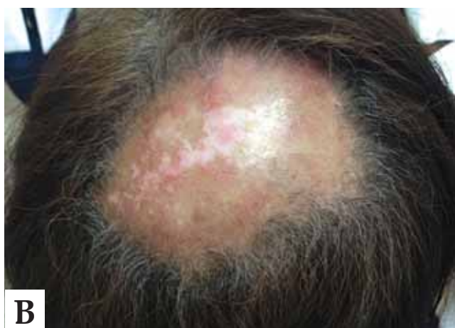
B. LED of the scalp. Because it shows central involvement, it is important to remember the differential diagnosis with CCCA in melanodermic patients

with retained hair shaft fragments, granulomatous inflammation (in advanced lesions) and intrafollicular and perifollicular infiltrates rich in neutrophils, and lymphocytes in pustular lesions. 37