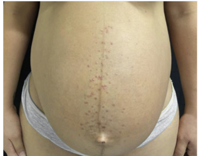
Figure 1 Erythematous papules and pustules located on the sternum and abdomen ( linea nigra ).

A 26-year-old primiparous female, at her 31 st week of gestation, reported the onset of pruritic skin lesions on the trunk, with two months of evolution. On physical examination, erythematous papules and pustules were observed on the abdomen (especially on the linea nigra ), on the sternum, the back, and the lateral surface of the buttocks (Figs. 1 and 2). Laboratory tests were requested and a biopsy of the dorsal pustule was performed. Laboratory tests did not disclose any abnormalities and the histopathological analysis showed a lymphocytic perivascular infiltrate, predominantly in the dermis, in addition to a hair follicle permeated by an inflammatory infiltrate with a predominance of neutrophils and destruction of the follicular structure (Figs. 3 and 4). The patient was treated with 5% benzoyl peroxide gel, with