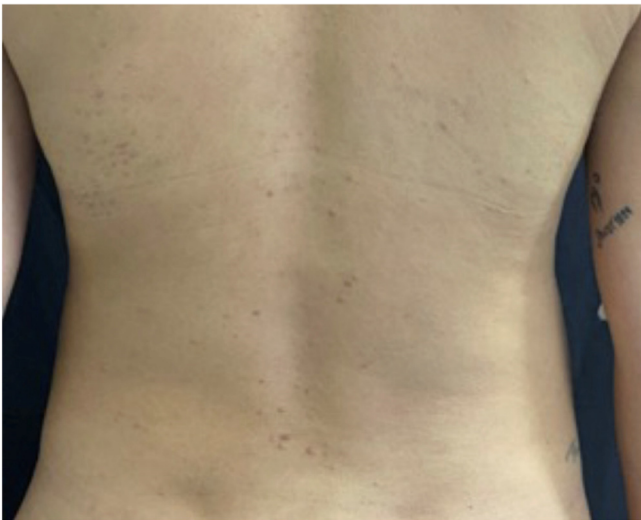
Figure 2 Erythematous papules located on the back.