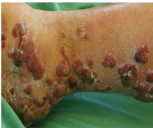
FIGURE 1: Infiltrated purple erythematous nodules and plaques grouped along the back side of the right leg, heel and plantar surface of the right foot

a population of B and T lymphocytes slightly decreased and T/NK lymphocytes slightly increased. Bone marrow aspiration did not reveal neoplastic lymphoid cells and immunophenotyping showed no monoclonal B or T cells. Histopathology of skin lesions revealed dense infiltrate of neoplastic lymphoid cells (Figures 2 and 3). Immunohistochemistry was positive for CD 20, CD 79 a and Ki-67 in 80% of the cells. Imaging examinations (x-ray and tomography) revealed an increase in bilateral inguinal, axillary and mediastinal lymph nodes; lymphadenopathy was considered nonspecific. In the Department of Oncology, chemotherapy with cyclophosphamide, adriamycin and vincristine was initiated. After two cycles, there was partial remission of the lesions.