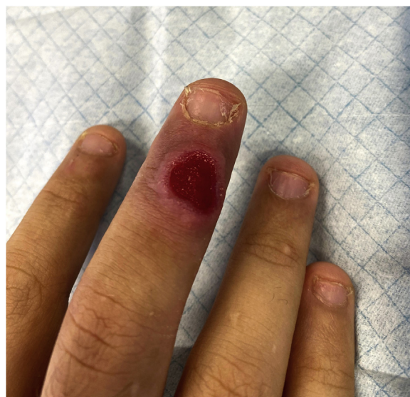
Figure 1 Ulcer on the third finger of the right hand.

Extragenital primary syphilis is a rare event, corresponding to 2%–7% of reported cases, 3 with the oral cavity being the most frequently affected area. 2,4 The natural history, treatment, and prognosis of primary lesions do not depend on their location.