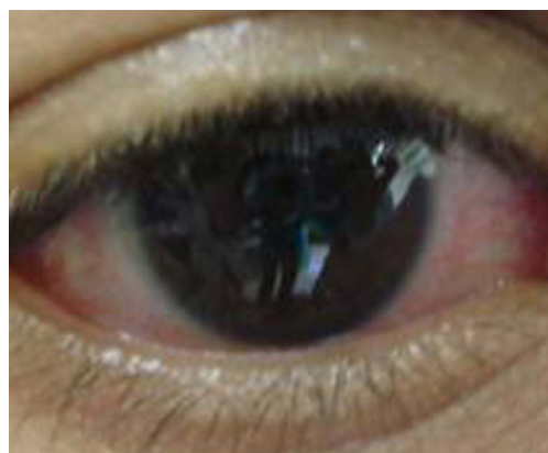
FIGURE 2: Conjunctival hyperemia secondary to uveitis