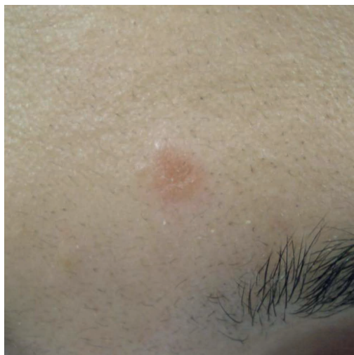
FIGURE 1: Papule on the forehead, with a translucent appearance and red-brownish color

thology results revealed sarcoid granulomas on the dermis (Figure 3). Tests for fungal and alcohol acid-fast bacilli were negative. The dermatology team opted for treatment with methotrexate (10mg/week) and prednisone (20mg/day), which resulted in clinical improvement.