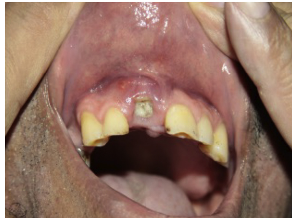
Figure 4 Dental abscess before starting immunobiological.

Actively looking for signs of infection, before and during biological therapy, should include 26,105 pulse and temperature; oroscopy and otoscopy; lymph node pal-