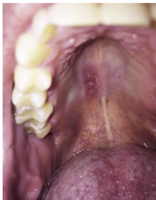
Figure 2 Oral candidiasis with the use of anti-IL17.

The risk of systemic fungal infections with anti-IL23 treatment in patients with psoriasis was investigated in 16 randomized controlled trials. No cases of severe fun-