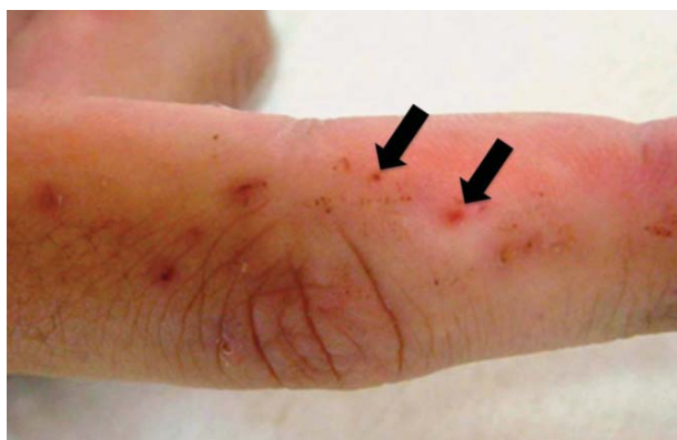
FIGURE 1 : Dermatitis Herpetiformis. Petechial lesions on the finger

The vicinity of a purpuric lesion on the second finger of his right hand was biopsied. Hematoxylin-eosin stain revealed a subepidermal vesicle with neutrophils infiltrate in the dermal papillae (Figure 3A). Direct immunofluorescence exam of the apparently normal perilesional skin revealed granular IgA deposits on the upper dermis (Figure 3B). The serum level of anti-transglutaminase IgA antibodies was 18U/ml (ELISA, normal range: under 10U/ml) and G6PD was normal. Dapsone 100mg per os was initiated. After 3 days, there was no pruritus, and a gluten-free diet was accepted. On the 20th day of treatment, we saw only residual hyperpigmented lesions.