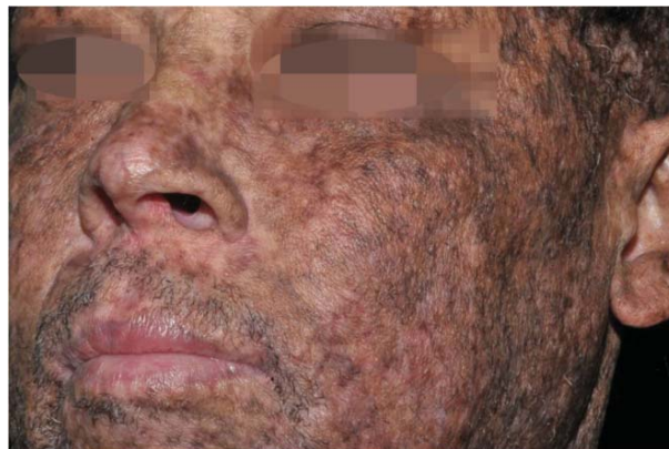
FIGURE 1: Graft-versus-host disease: spotted hyper and hypopigmented skin on the face

interface dermatitis and scattered apoptosis of keratinocytes plus superficial sclerosis, vascular proliferation and mild lymphocytic infiltrate, suggestive of late evolution of lichenoid lesions (Figures 5 and 6).