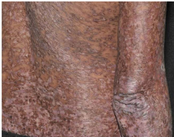
FIGURE 4: Graft-versus-host disease: more evident lichenoid and atrophic lesions on the back