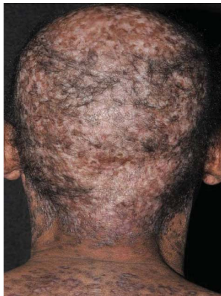
FIGURE 2: Graft-versus-host disease: scalp with alopecia and spotted hyper and hypopigmented skin plus lichenoid lesions