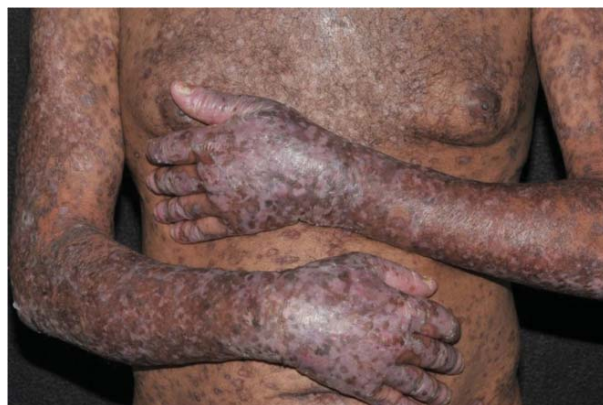
FIGURE 3: Graft-versus-host disease: lichenoid lesions, edema and erythema on the hands with associated onychodystrophia