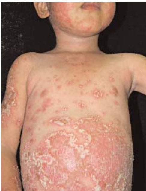
FIGURE 1: Erythematous plaques, desquamative, bordered by great number of pustules on the trunk

every 12 hours and 10 ml of ferrous sulfate daily. The condition evolved in three months with weight loss following the suspension of topic corticosteroid, resolution of fever and improvement in adynamia. There was partial regression of the previously mentioned lesions although new lesions appeared. The patient presented pustules with erythematous basis on the back, abdomen and thorax (Figures 5 and 6). Dapsone was kept and it was planned to introduce cyclosporin in case there was not a satisfactory response to the treatment.