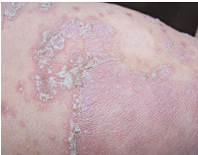
FIGURE 5: Erythematous plaques still with bordered pustules, after 3 months of treatment

As for this report the patient presented family history of similar lesions, which reinforces the important role of heredity in psoriasis. 4 Possible differential diagnoses include staphylococcal scalded skin syndrome, Reter's syndrome, generalized candidiasis, atopic dermatitis, seborrheic dermatitis, pustular mil-