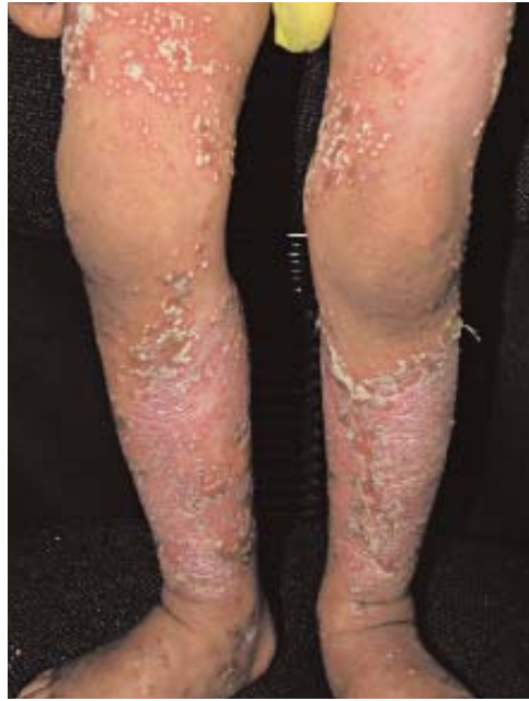
FIGURE 2: Desquamative plaques with numerous pustules superimposed on the lower limbs. (HE; 100X)

The patient was medicated with 5 mg dapsone