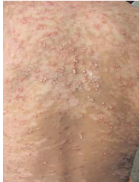
FIGURE 6: Residual hypochromic lesions with scattered pustules