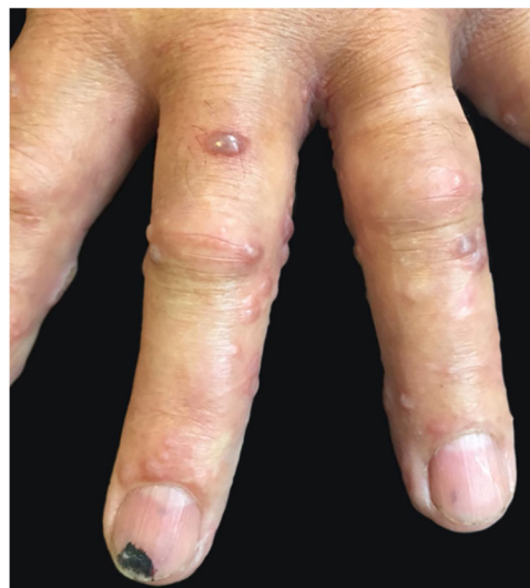
Figure 1 Multiple vesicular lesions affecting the left forearm and left hand.

We report a case of concurrent reactivation of VZV and HSV in an immunocompetent elderly male with no clinical history of herpes simplex but with serologic evidence of past infection. The combination of high sensitivity and specificity, low contamination risk, and speed has made