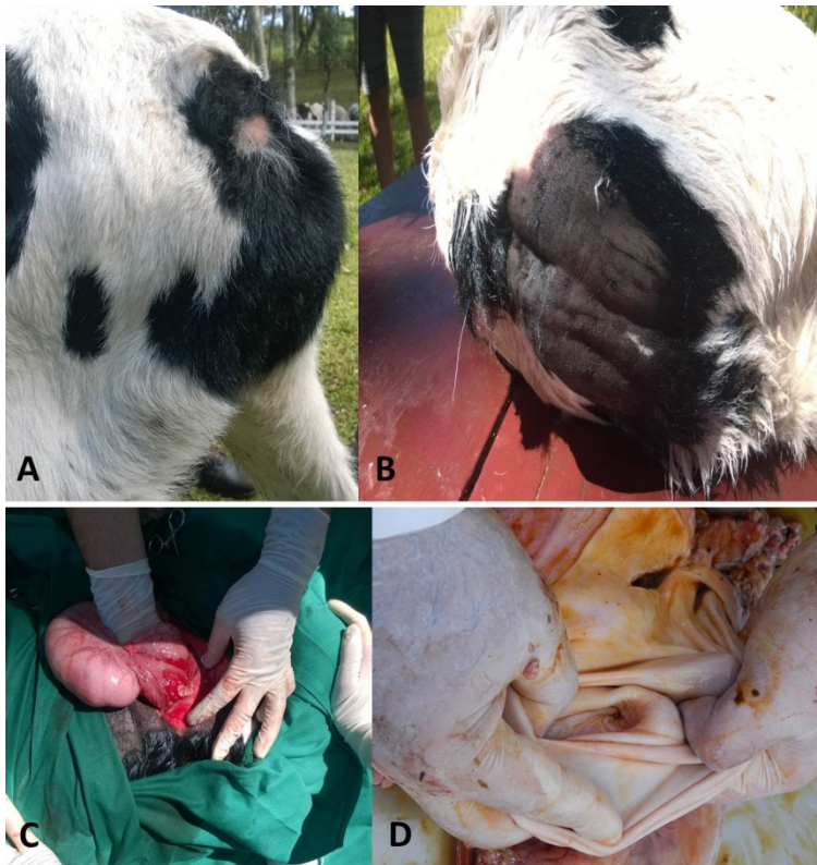
Figure 1. Bovine with congenital multiple arthrogyryposis. A and B: Perineal region with anal atresia, pelvis malformation and agenesis of the coccygeal vertebrae. C: Macroscopic image of part of the uterine horn during the surgery. D: uterine cervix found on necropsy.

Inside the uterine horns there was a yellow-green liquid content, moderately viscous, odorless, and associated with the presence of nodular pasty formations characterized as meconium. The large intestine and rectum had a marked expansion in the distal segment, and communicated with the