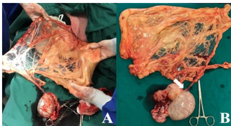
Figure 2. Intraoperative findings during unilateral orchietomy procedure in a Criollo stallion diagnosed with non-strangulated inguinoscrotal hernia. A: Exposure of the herniated content presenting the omentum in the scrotal region. B: Herniated content after omentum excision and left orchietomy. Note the decreased testis size and the adhesion point between the omentum and the testis (white arrow).

taking care to avoid injuring the underlying structures. The presence of omentum (Figure 2A) and of a large amount of fluid was evidenced at the time when the tunica albuginea was opened. All the scrotal contents were examined; the herniated content involved the testis and was adhered to it at one point (Figure 2B), although there was no sign of ischemia. The testis was flaccid and decreased in size. Then, the animal was subjected to orchietomy on the left testis and, subsequently, to resection of the herniated omentum. Finally, the left inguinal ring was examined and showed no changes.