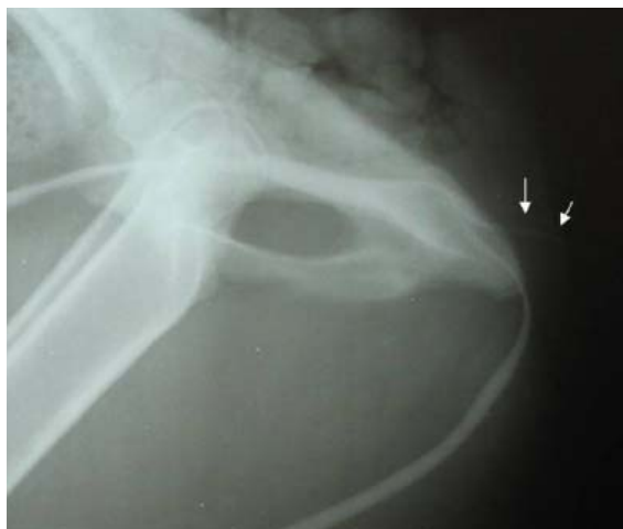
Figure 1. Retrograde urethrogram in a dog showing a normal distal urethra and an accessory urethra (arrows).